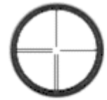
Filar/bifilar reticle pattern

Multiple capabilities. The eyepiece of the 545-190 may be interchanged with accessories (listed below) to provide autocollimation, autoreflexion, and reticle projection capabilities, just like our transits. The reticle's filar/bifilar pattern makes for easy use with our optical tooling scales, or during collimation or autocollimation procedures.